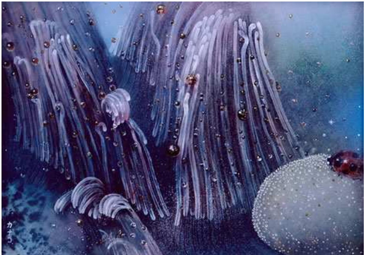
Jewel of life - mushroom, 2007