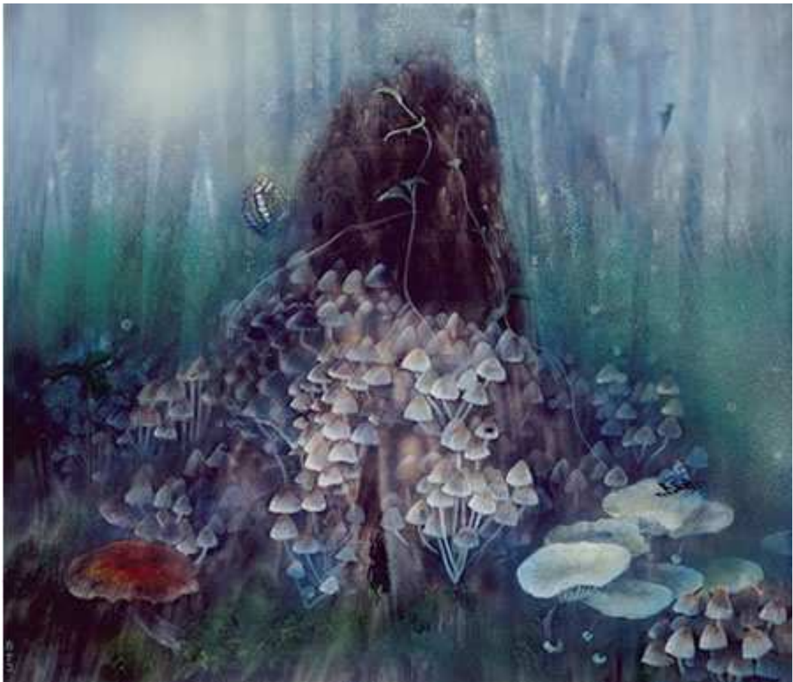
Island of mushroom, 2007 53 x 45.5