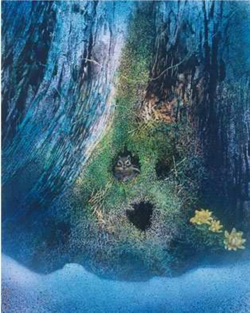
Awakening, 2006 27.3 x 22