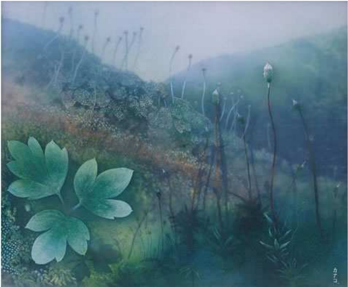
Crust of forest – Waltz of moss, 2006 45.5 x 37.9