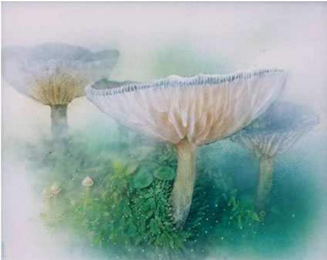
Listen, Listen, 2005 40.9 x 31.8