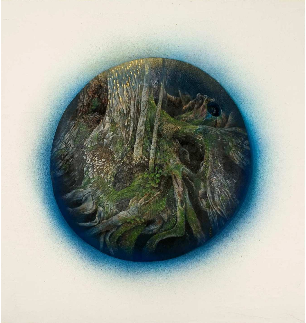
ROOTS, 2007 96 x 96