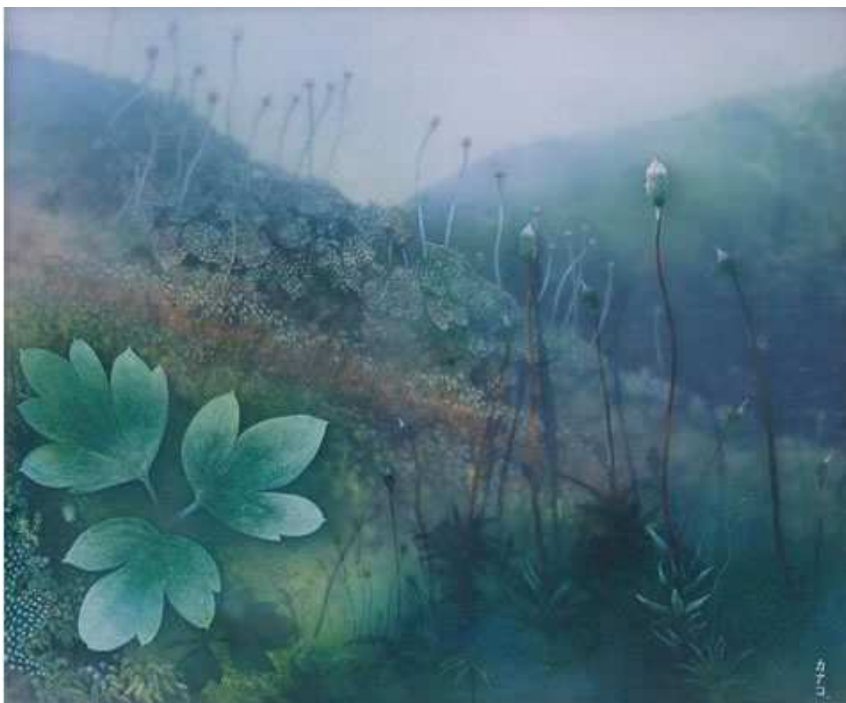
Crust of forest – Waltz of moss, 2006 45.5 x 37.9