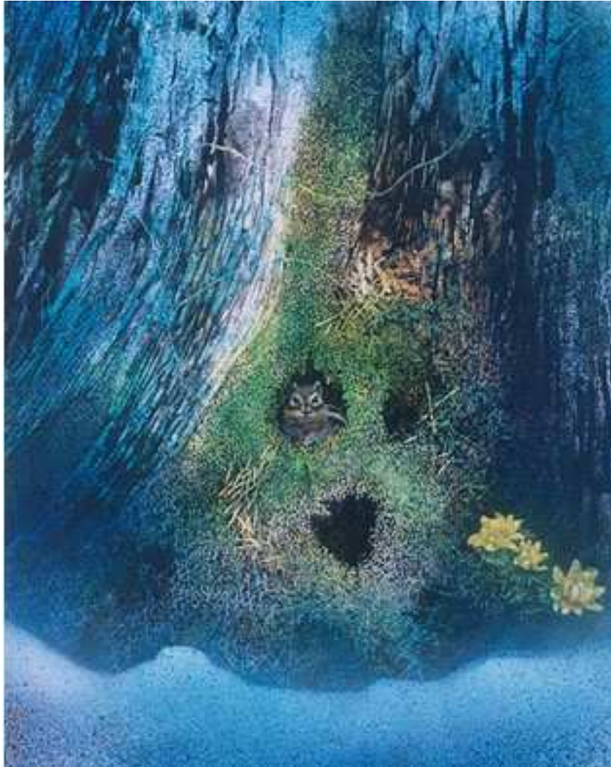
Awakening, 2006 27.3 x 22