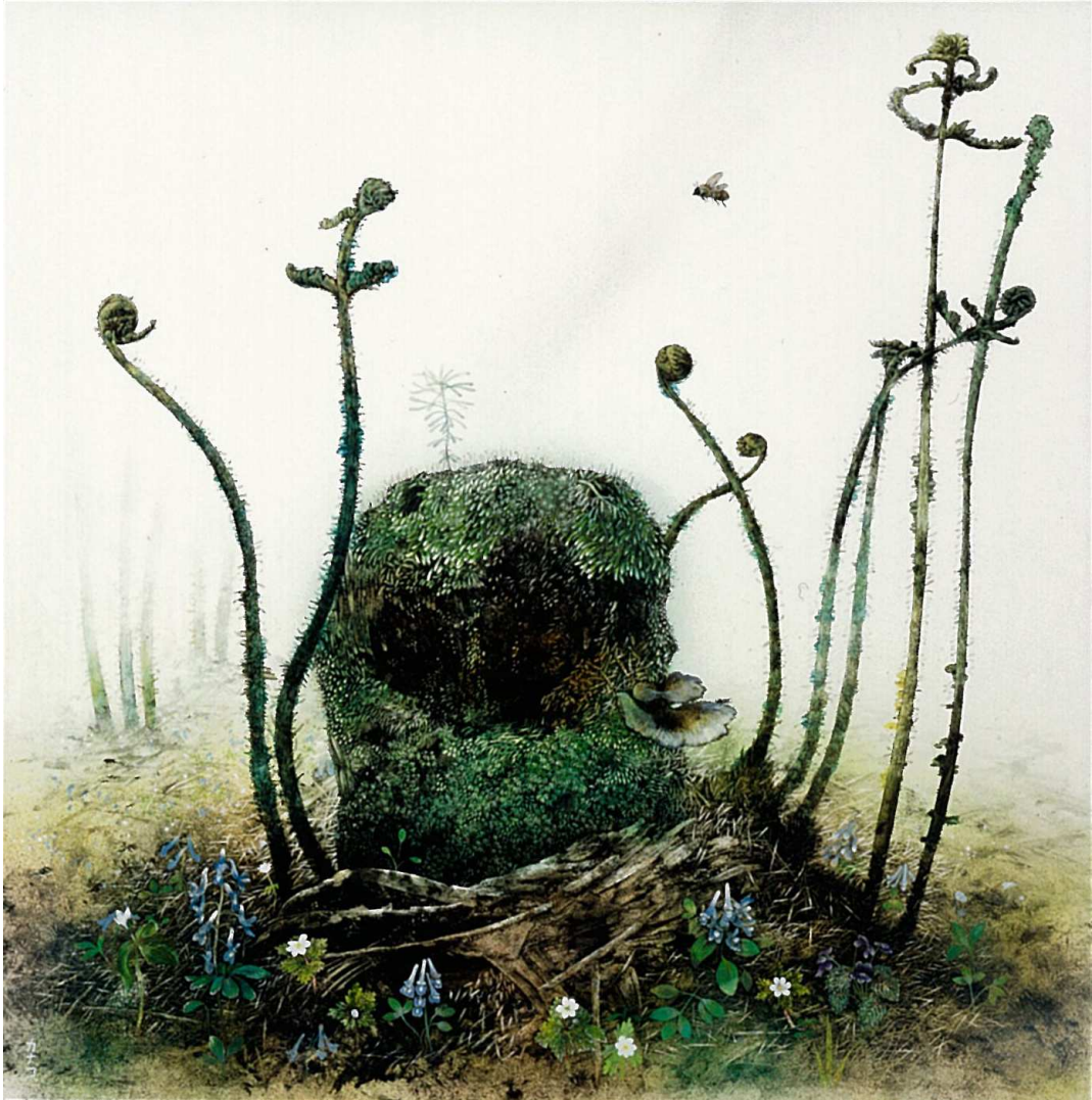
Spirits – Vernal fellow, 2004 60 x 60