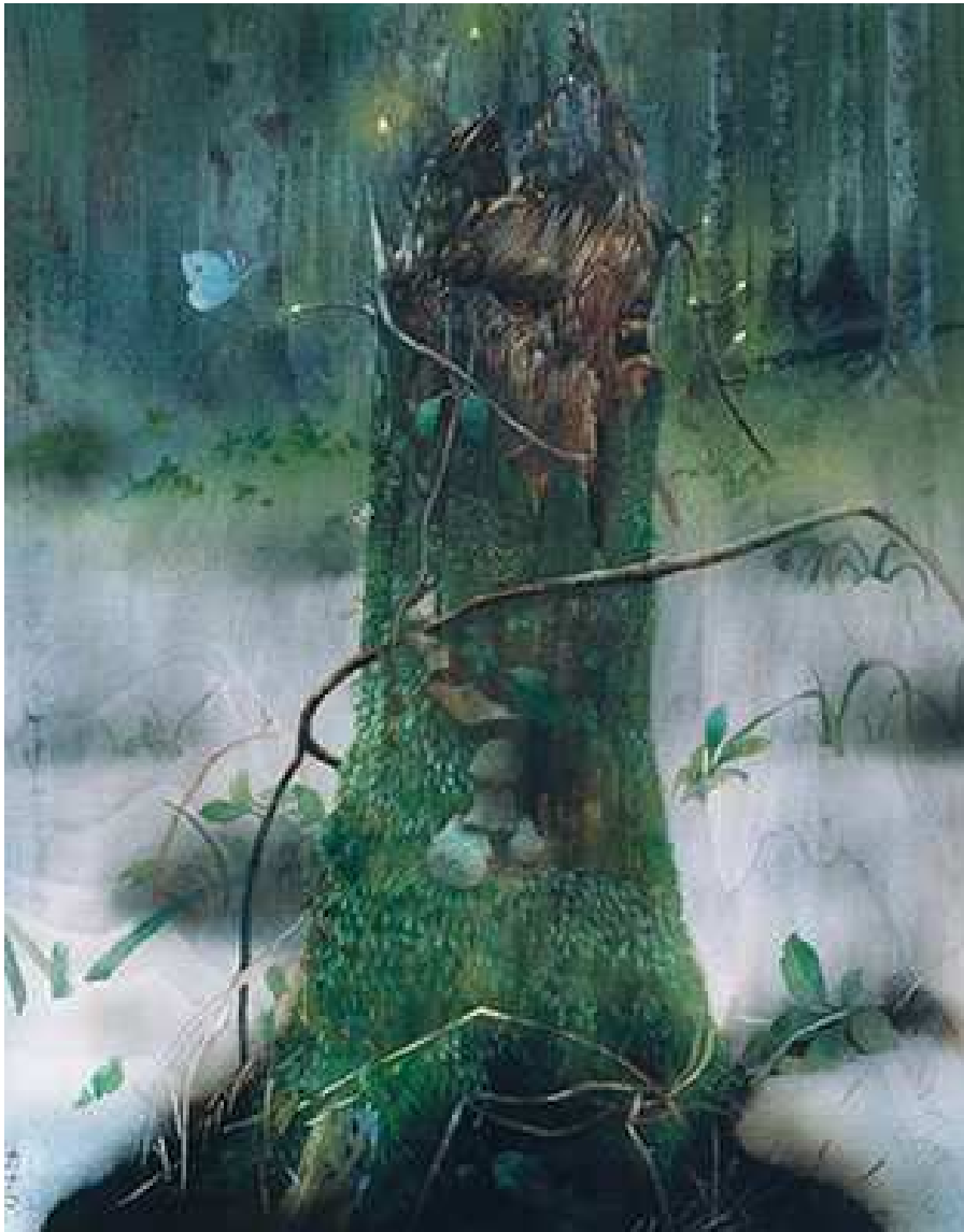
Spirits of stump, 2004