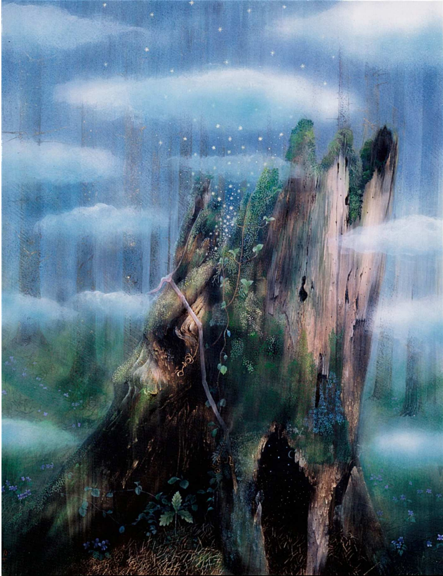
In a dream, 2006 90.9 x 72.7