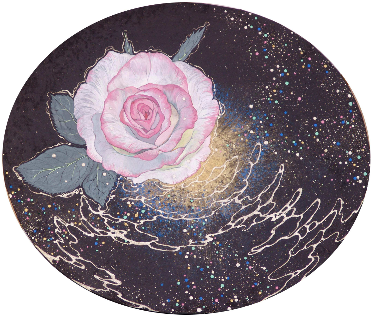
Memory of water (Night and Rose), 2007