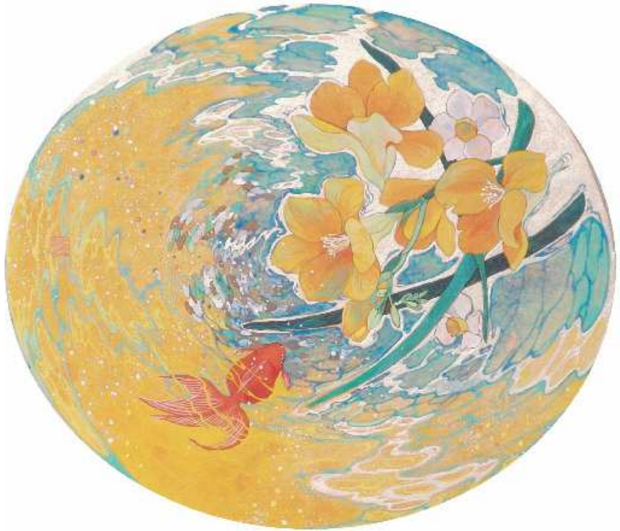
Memory 26 x 30