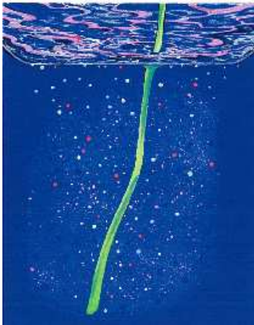
Flower in a glass (Orchid)