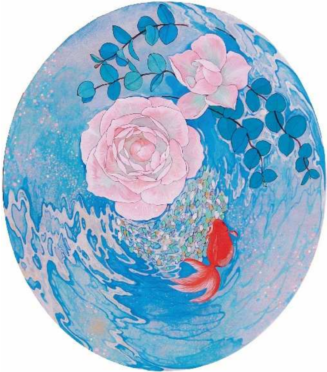
Memory of water (rose)