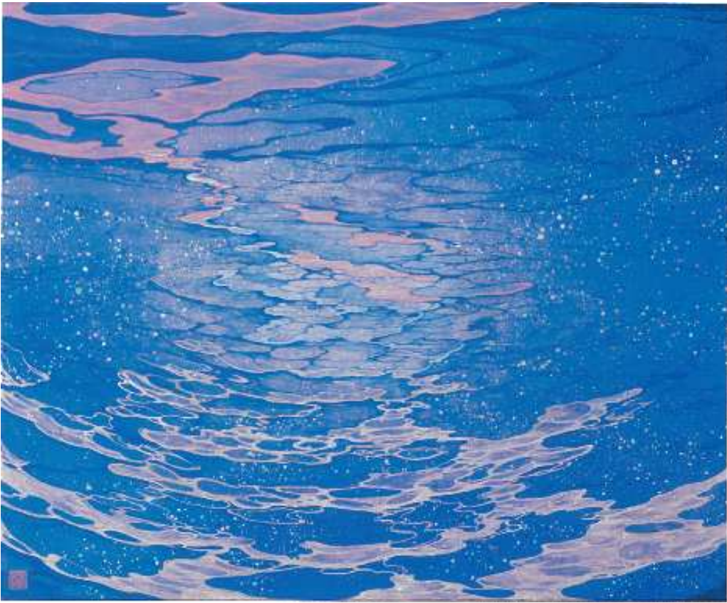
Odette 60.6 x 50