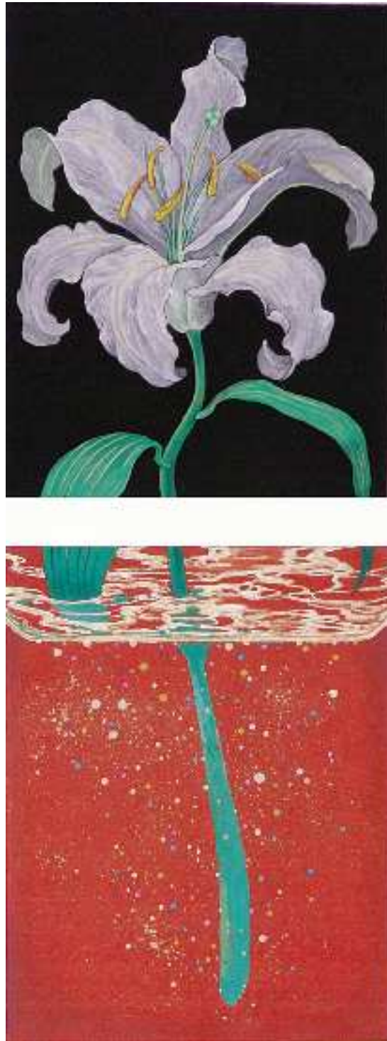
Flower in a glass (Lily)