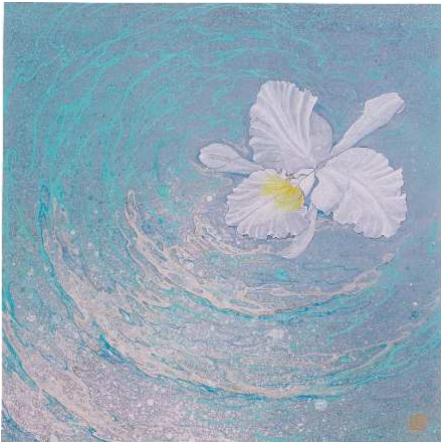
Cattleya 37.9 x 45.5