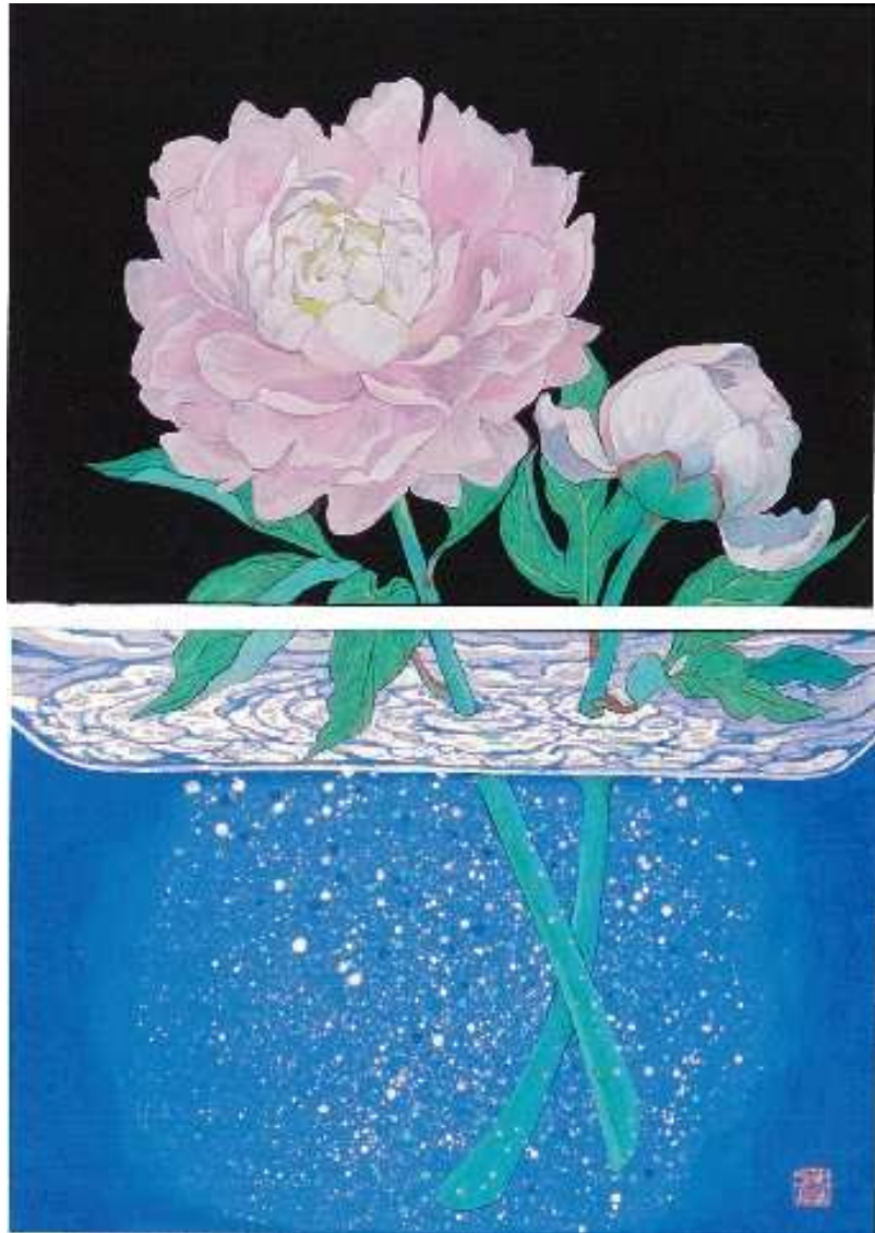
Flower in a glass (Peony)