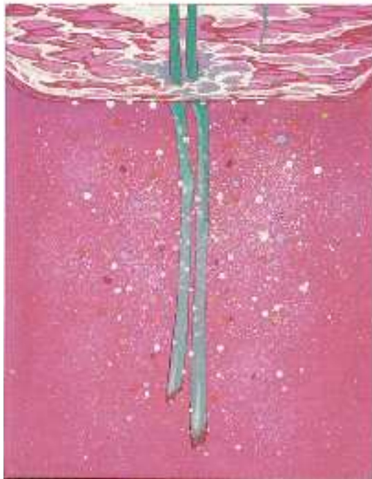
Flower in a glass (Turkish bellflower)