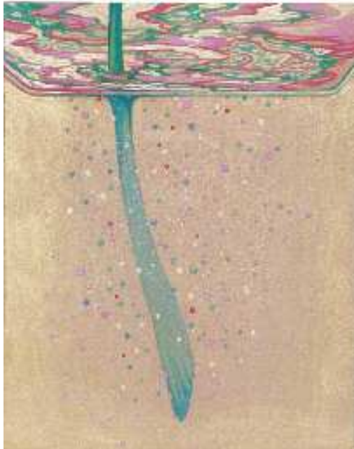
Flower in a glass (Peony)