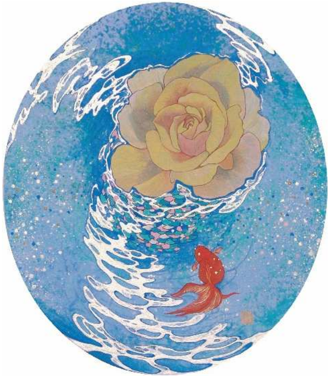
Memory of water (Rose and Sky) 30 x 26