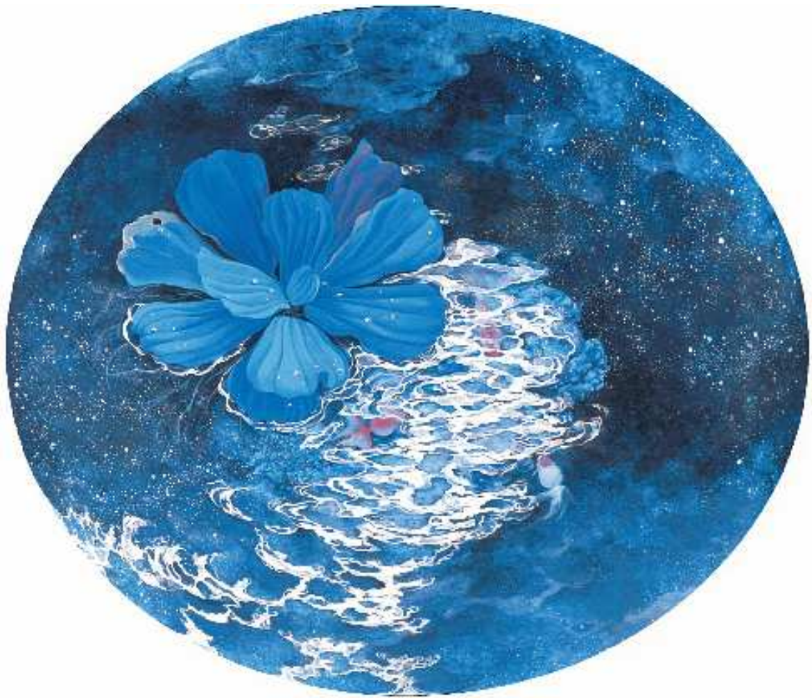
Round microcosm (Moonlight), 2006 84.5 x 100