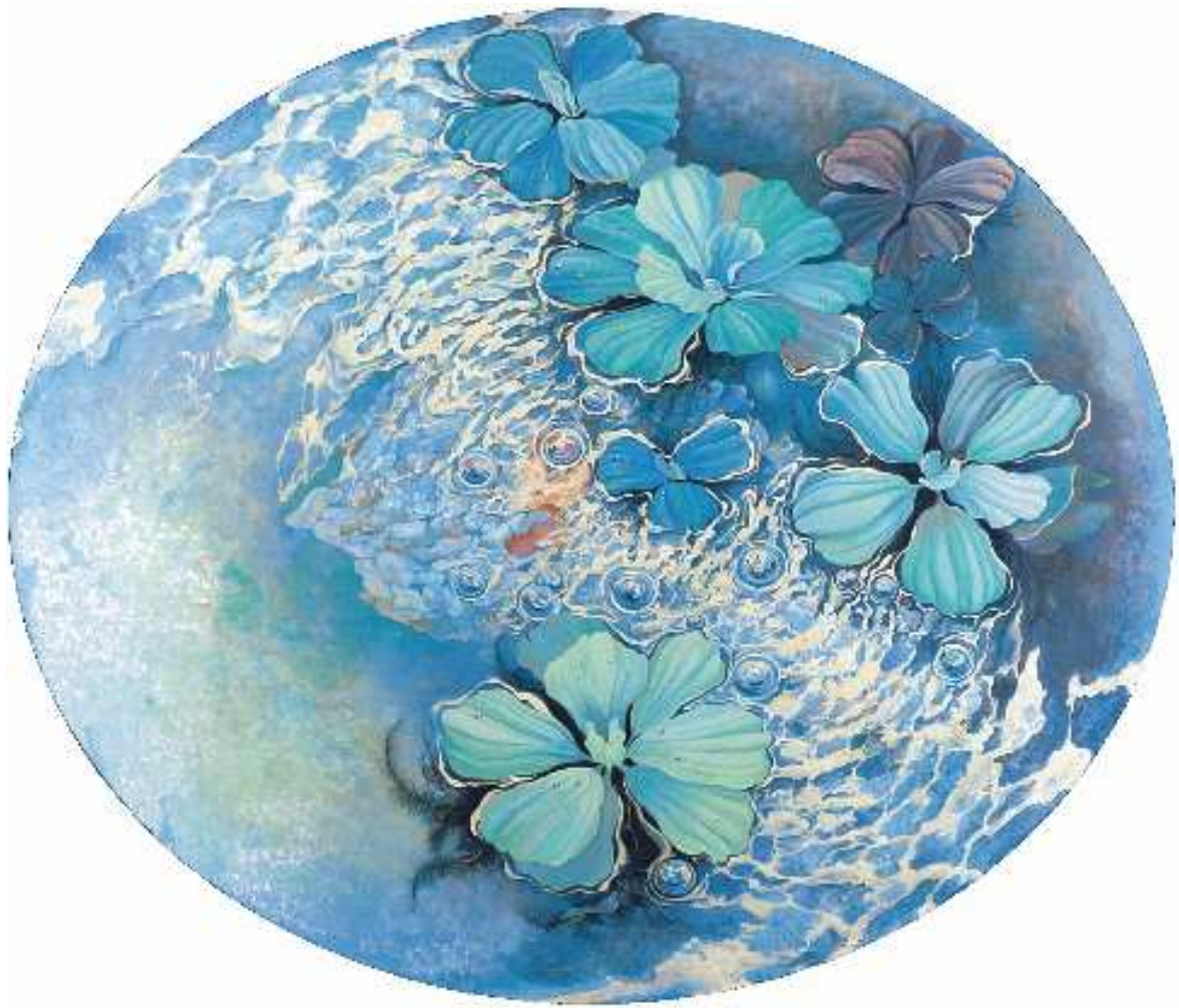
Round Microcosm (Daylight) 84.5 x 100