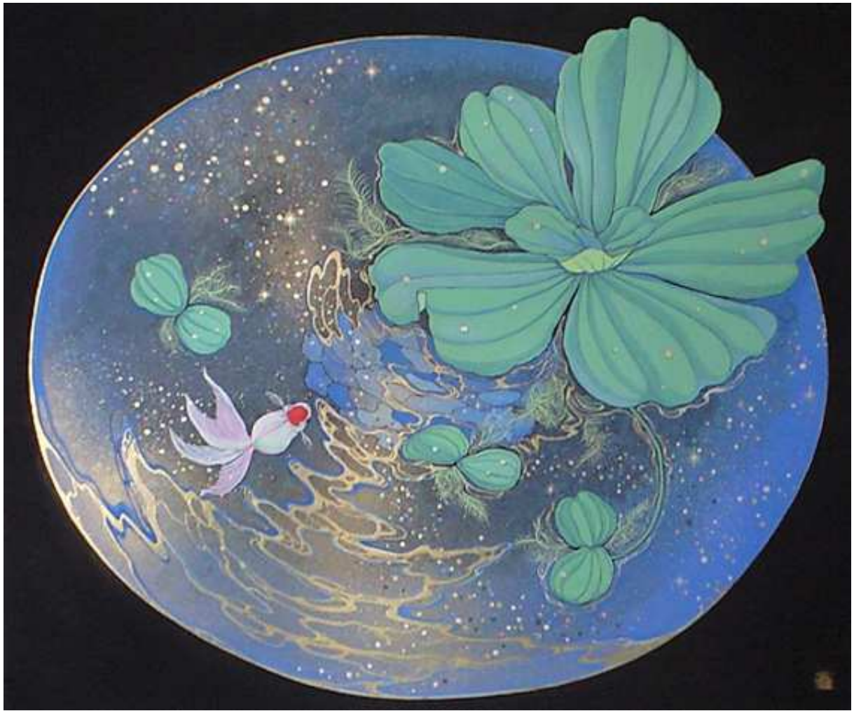
Round Microcosm, 2006 53 x 45.5