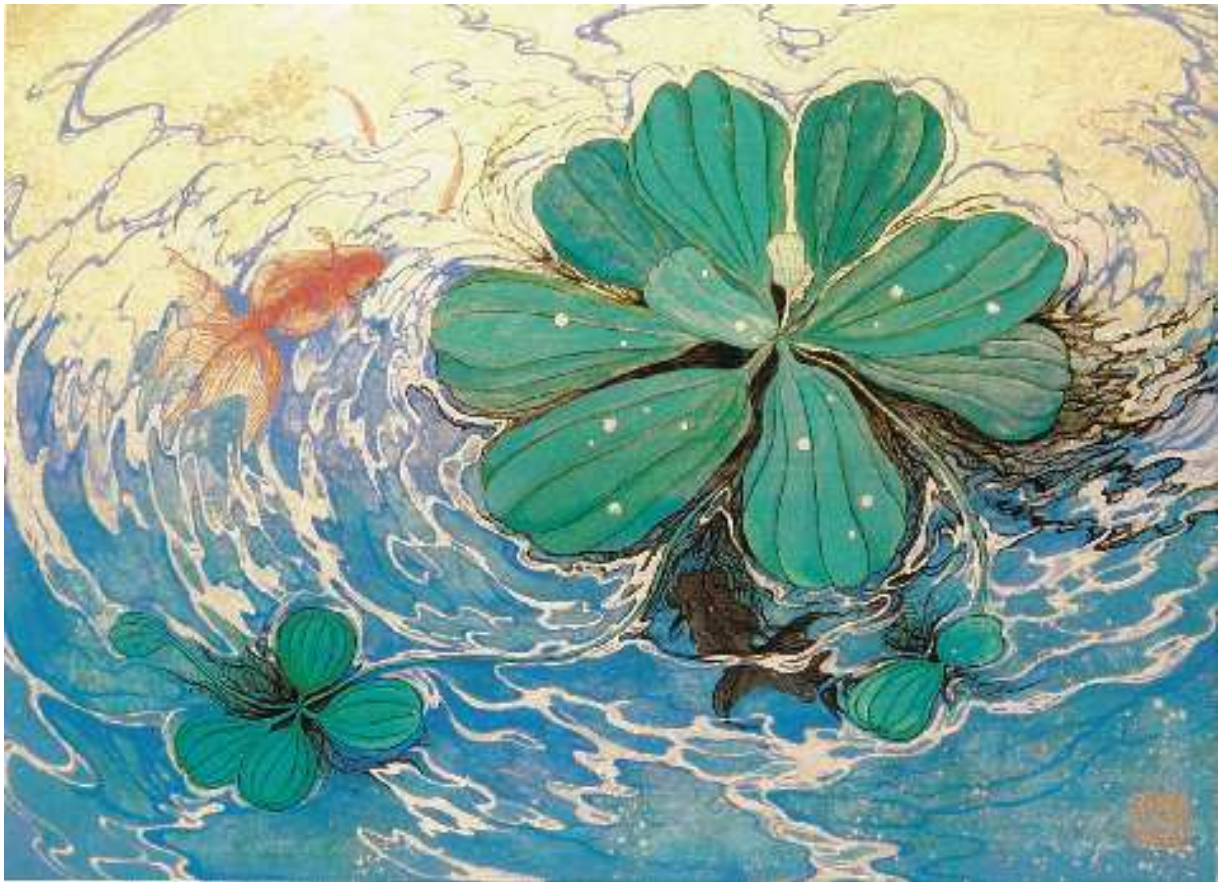
Ripple 33.4 x 24.3